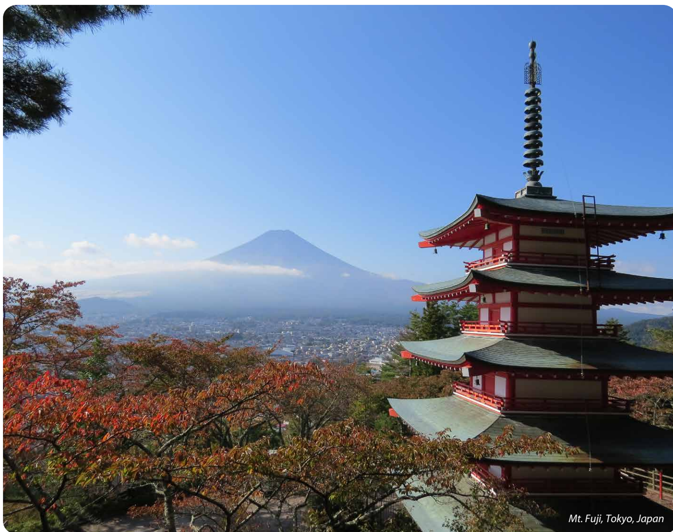
Mt. Fuji, Tokyo, Japan

December 15, 2015 | Rosewood Hotel, Abu Dhabi, UAE