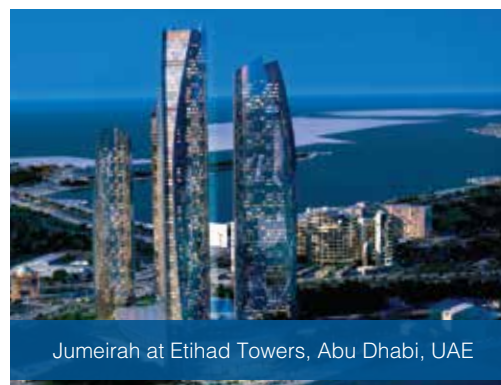
Jumeirah at Etihad Towers, Abu Dhabi, UAE