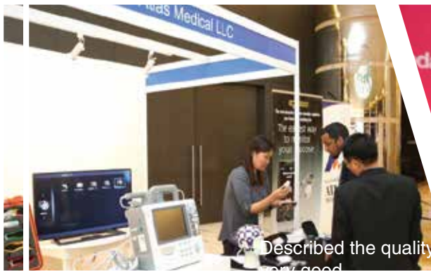
Described the quality of visitors was very good