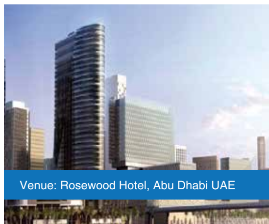
Venue: Rosewood Hotel, Abu Dhabi UAE